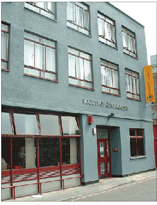
The Society of Genealogists library in London, England

10-minute walk from the Barbican Tube subway station. When you exit the station, turn to your left and walk about a quarter mile on Goswell Road until you come to a large intersection with traffic lights where Goswell Road and Clerkenwell Road come together. Just before you get to that corner is a Starbucks cafe on the left where you can get lastminute refreshment, or you can leave a nongenealogical companion to enjoy Starbucks' free Internet access while you walk the last several minutes to the library.