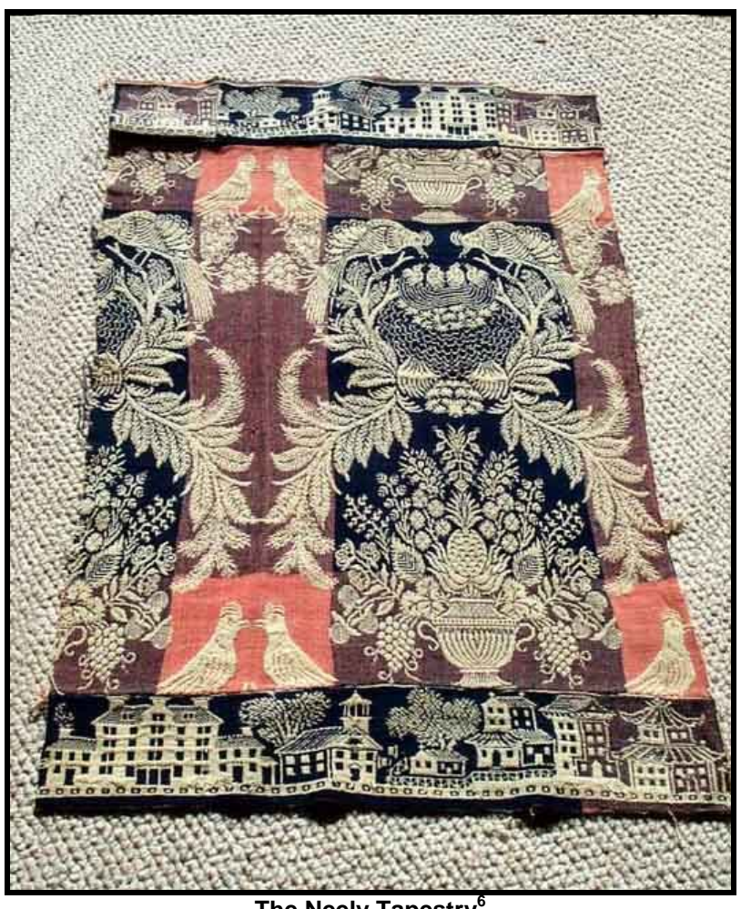
The Neely Tapestry<sup>6</sup>

Glenn wrote back and asked if I could e-mail a picture of the tapestry. So, out came the new camera and the tapestry. I found the perfect place on the beige carpet with the afternoon sun shining on the carpet. The picture was taken, transferred to the computer, and sent off to Glenn that afternoon.